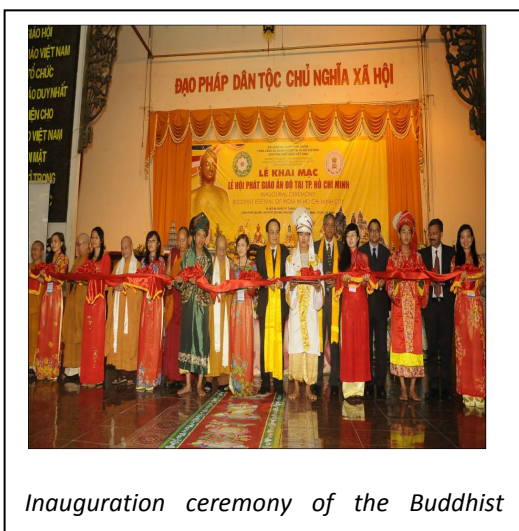
Inauguration ceremony of the Buddhist