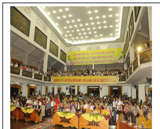
People gathered at the inauguration of Buddhist Festival – 7 March 2014