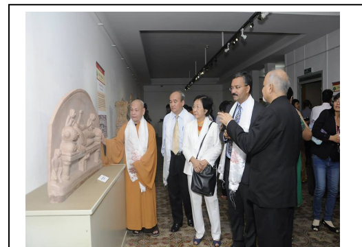
Visitors to the Buddhist Exhibition -6 March