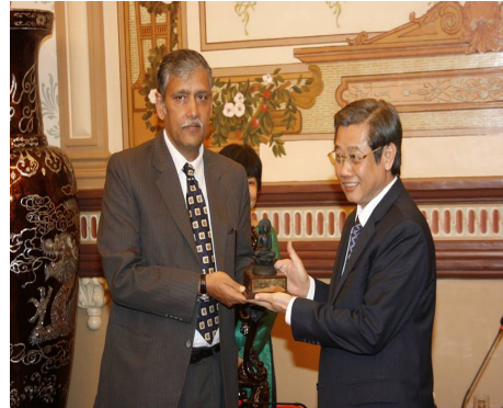
Secretary (Culture) during meeting with the Vice Chairman of People’s Committee – 7 March