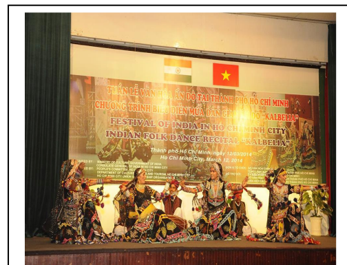
Rajasthani Folk Dance Recital by Kalbelia group – 12 March